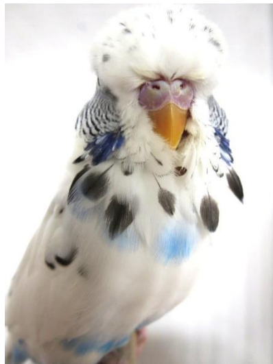
Best Adult Feather Intermediate owned by Myles Henke.