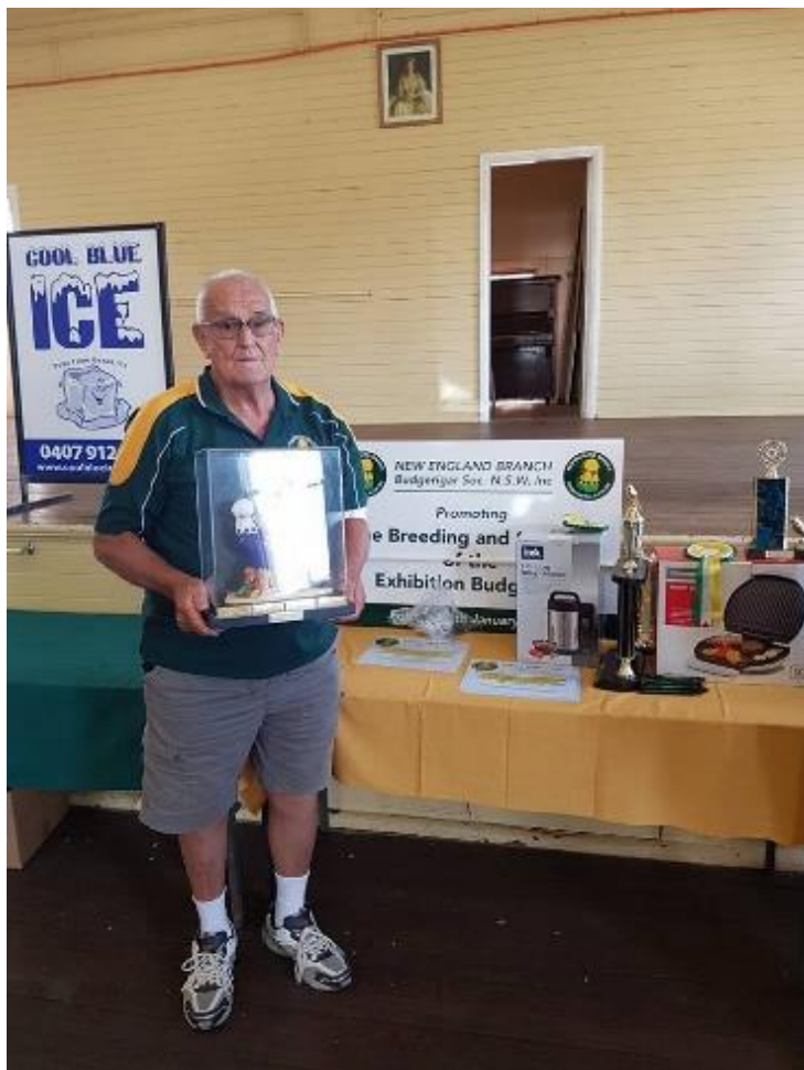
2017 New England Annual Show Grand Champion with a Spangle AOSV cock

Below are a couple of the birds that I exhibited during the 2017 show season.