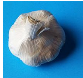
Garlic is not only very effective in combating mites of all kinds, it is also a natural de-wormer.

As with any additive administered via drinking water it is important to continue each for 5-7 days. At certain times of the year budgies do not drink much (except when raising young or in hot weather) so continuing any treatment for 5-7 days ensures they get a good dose.