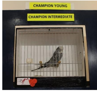
Best Young Bird Intermediate – Brian Goldsmith