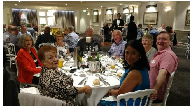
Manly Warringah Avicultural table.