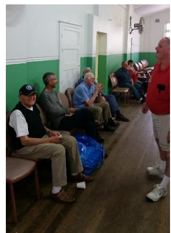
Exhibitors watching the judging at the St. George & Illawarra YBS.