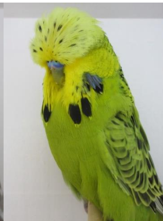
2016 ANBC National Third Place Opaline