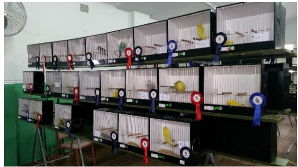
Display of special award winners.