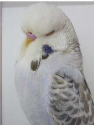
2016 ANBC National Second Place Fallow