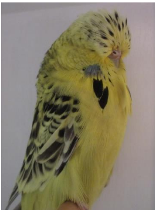
2017 ANBC National Third Place Clearbody

Top three places at the ANBC Nationals from 2017 to 2014