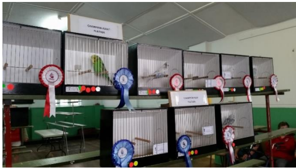
Display of major award winners.