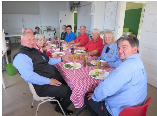
Having lunch after judging.