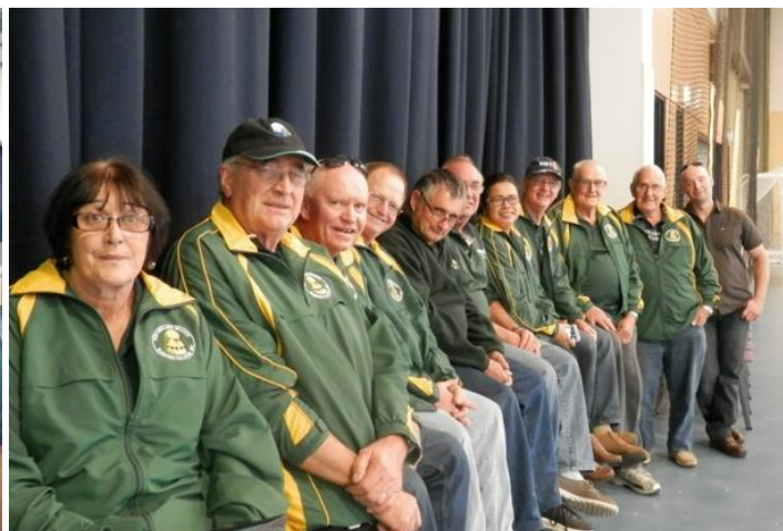
The New England team at the STCC held on 11 June 2016 at the Dural Sport And Leisure Centre