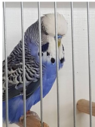
2017 New England Annual Show Best Violet