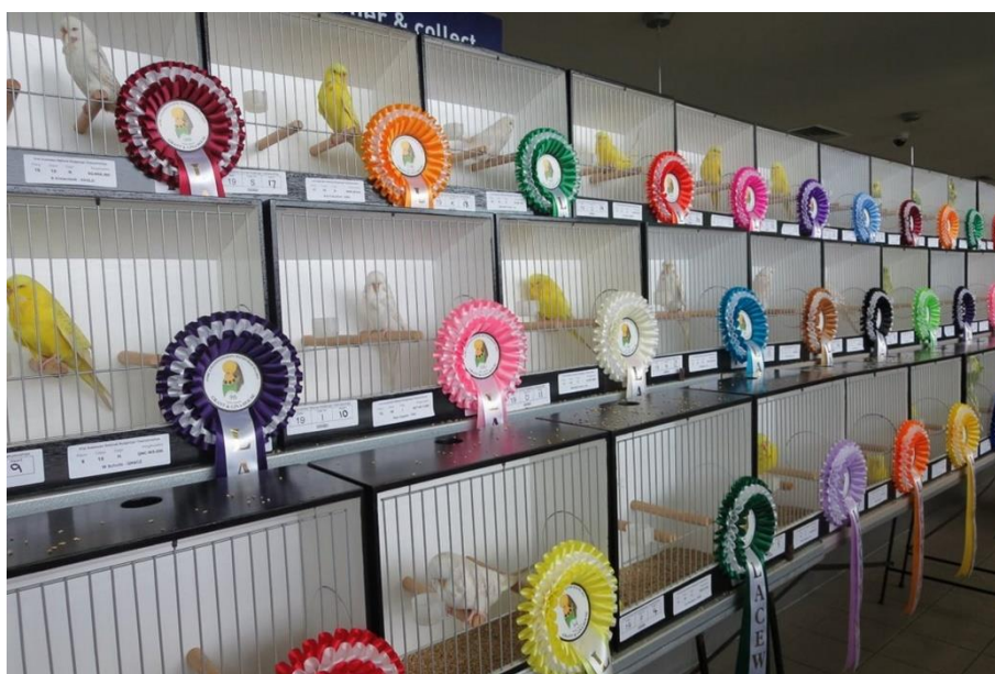
Display of Variety Rosettes at the 2015 ANBC National.

We only get to host the National Budgerigar Event once every seven years, so here is an opportunity to get together with family, friends and fellow Club members in order to sponsor a Variety and make this a most memorable event.