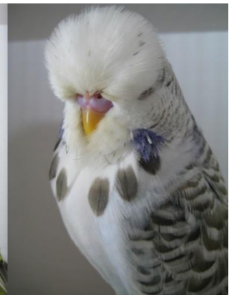
2014 ANBC National Second Place Fallow