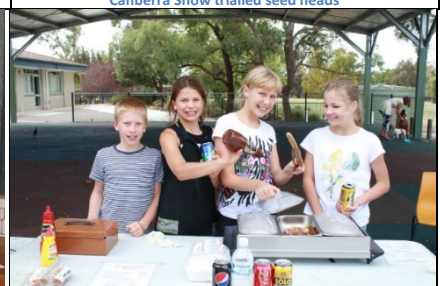
Great to see the children helping with BBQ