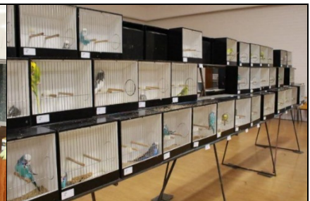
Canberra Show trialled seed heads