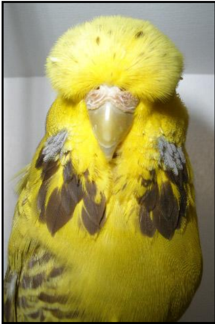
At right: Cinnamon Opaline Grey Green hen