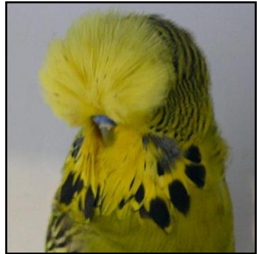
Outstanding Grey Green Cock