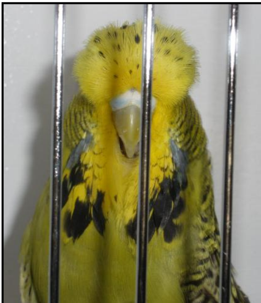
2008 Normal Grey Green hen daughter of Grey Green cock (above)