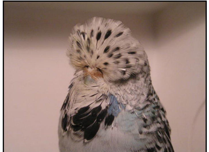
Opaline Grey hen – sister of Grey Green Cock (above)