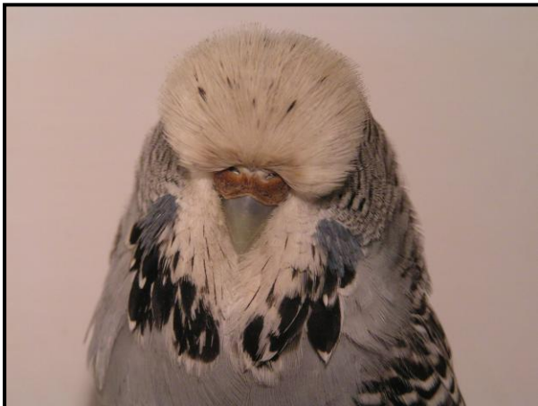
Normal Grey hen – mother of Grey Green cock (above)