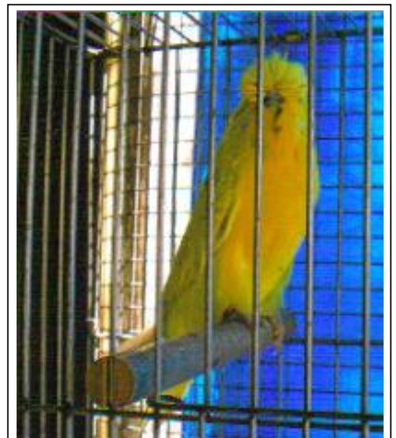
Black Eyed Cock Brother of the 2007 National winner