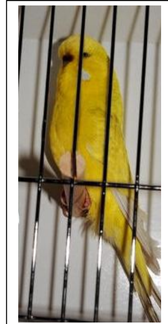
Winner 2006 National Black Eyed Self Colour Judges comments: First place getter is a very good Hen- up to size with the depth of mask and good width in skull. Very good variety content and colour.