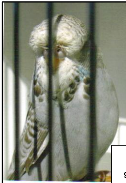
Cinnamon Grey Hen 9 weeks old