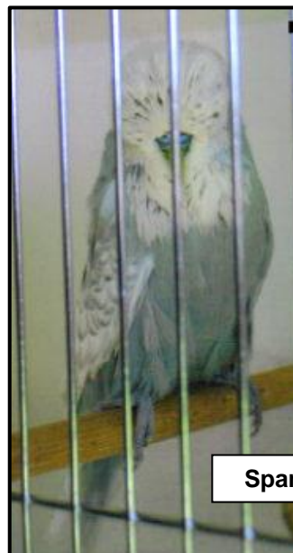
Spangle Grey Cock