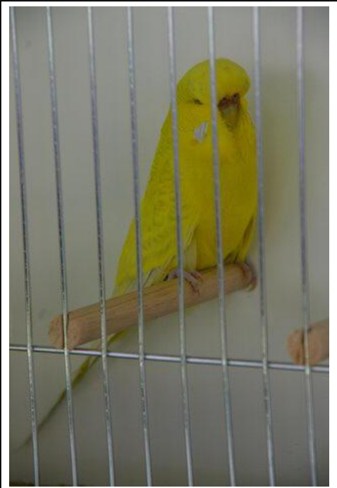
Winner 2008 National Black Eyed Self Colour Judges' comments: Lovely width of face, good feather and strength through the body. It was a clear selection