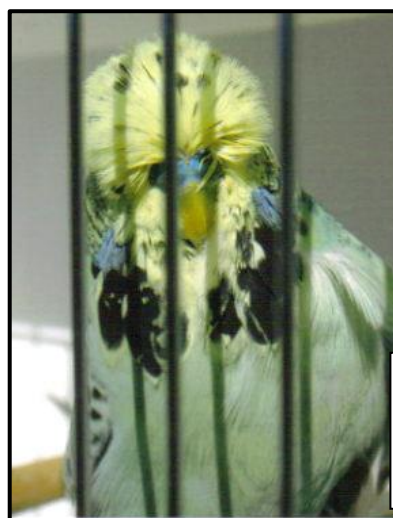
Opaline Yellow Face Grey Cock 2007 bred